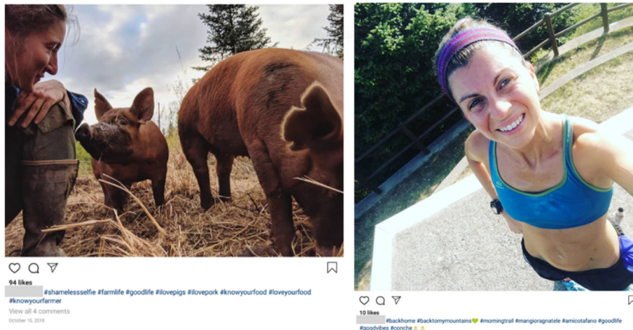
Fig. 3 Two posts illustrating the good life narrative as shared experience

experiences with others. In this context, significant others are celebrated for themselves and for the enjoyment that they bring to shared activities. While in this sample users did not create art with others, they actively sought to engage an audience. Of course, an artist's status is increased through the valorisation of their work, and pleas for the audience to appreciate one's art can be understood as manifestations of narcissism. But they can also be seen as the manifestation of the changing expectations of an artist's work that result in increased pressure on artists to engage viewers on social media [52].